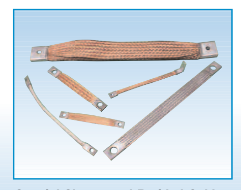
Special Shunts and Braided Cable