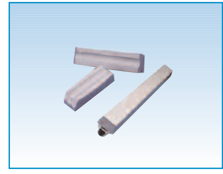
Shoes and Pantograph Carbons