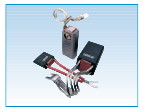
Carbon Brushes Industrial, Fractional, Molded and Metric