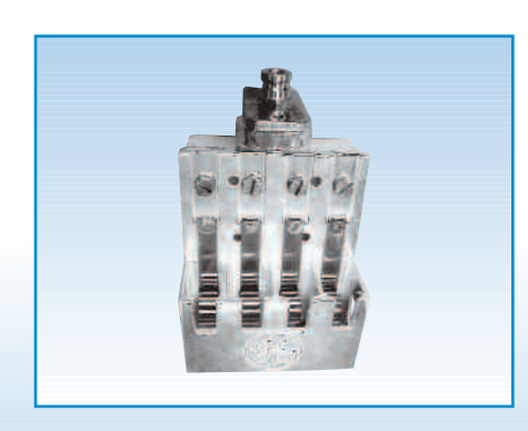
Brush Holder Repair