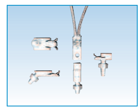
Helwig Quick Disconnect Saves Time, Safe, Better Construction